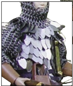
(Detail of scales and cross bow shown)