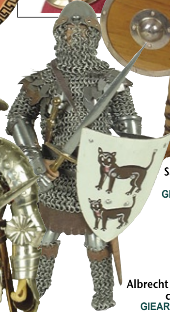
Albrecht von Hohenloe c. 1325 GIEARM-32 $89.99