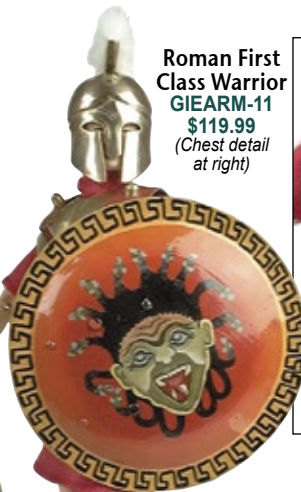
Roman First Class Warrior GIEARM-11 $119.99 (Chest detail at right)