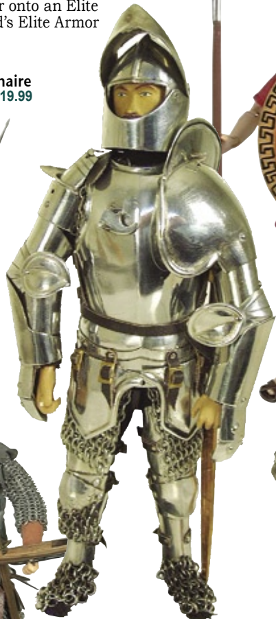
Italian Knight with Chainmail c. 1500 GIEARM-39 $149.99