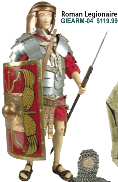
Roman Legionaire GIEARM-04 $119.99

Real steel, hand hammered a piece at a time, then painstakingly fitted together onto an Elite figure body....that's how Cotswold's Elite Armor series is made.