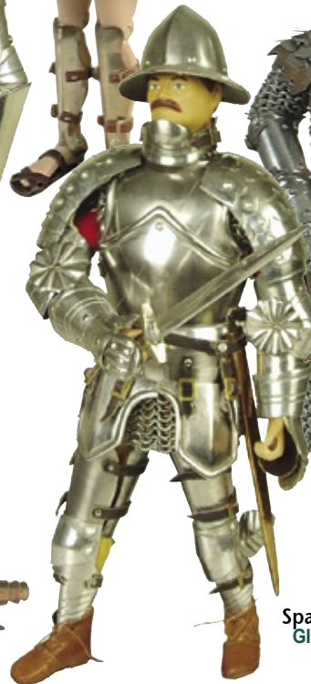
Spanish Man at Arms GIEARM-15 $149.99