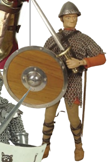
Saxon Housecarl c. 11th c. GIEARM-30 $89.99